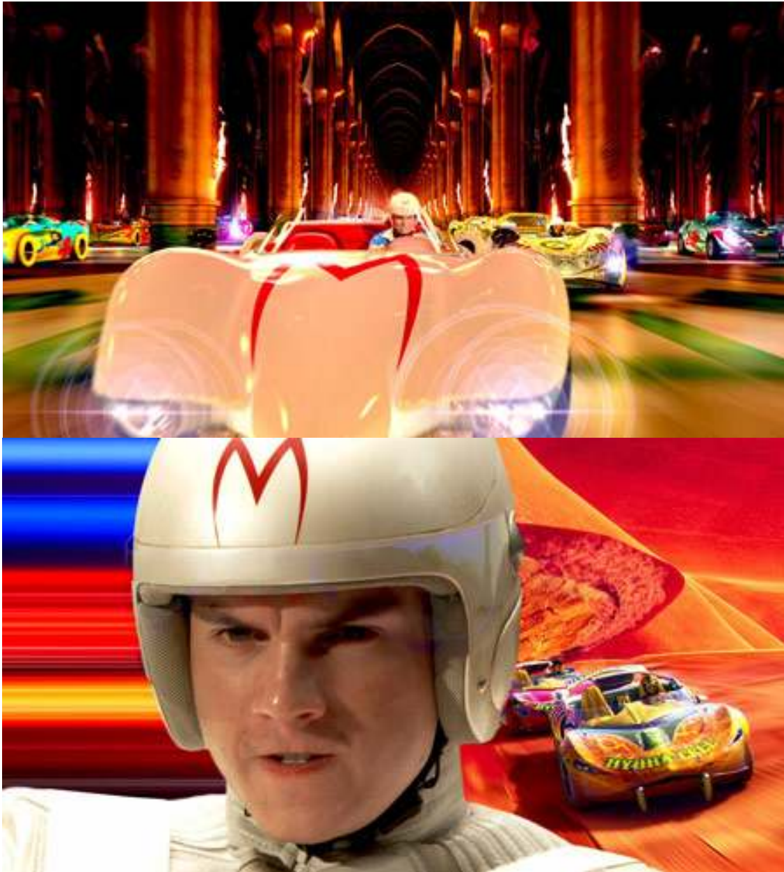
EMILE HIRSCH as Speed Racer in the Mach 5, in a scene from Warner Bros. Pictures' and Village Roadshow Pictures' action adventure "Speed Racer," distributed by Warner Bros. Pictures.